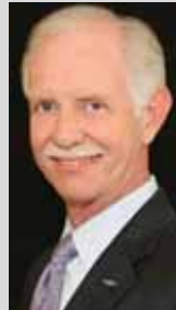
Captain "Sully" Sullenberger to Keynote on Thursday

Captain Chesley "Sully" Sullenberger III will be our keynote speaker this year. The pilot of the "Miracle on the Hudson," US Airways flight 1549, will speak on the importance of planning for safety and personal responsibility. Join him on Thursday, November 5, from 9:00 a.m. - 10:00 a.m. All AGRSS-registered companies may also join Captain Sullenberger for a private meet-and-greet breakfast from 8 a.m. - 9 a.m. Don't miss this exclusive chance to meet this modern-day hero dedicated to safety.